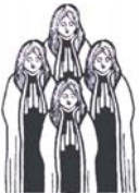
Firhouse Community College