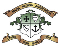
Loreto College Foxrock